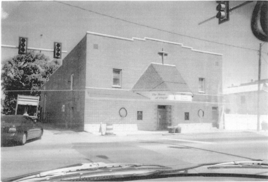
1 st photo