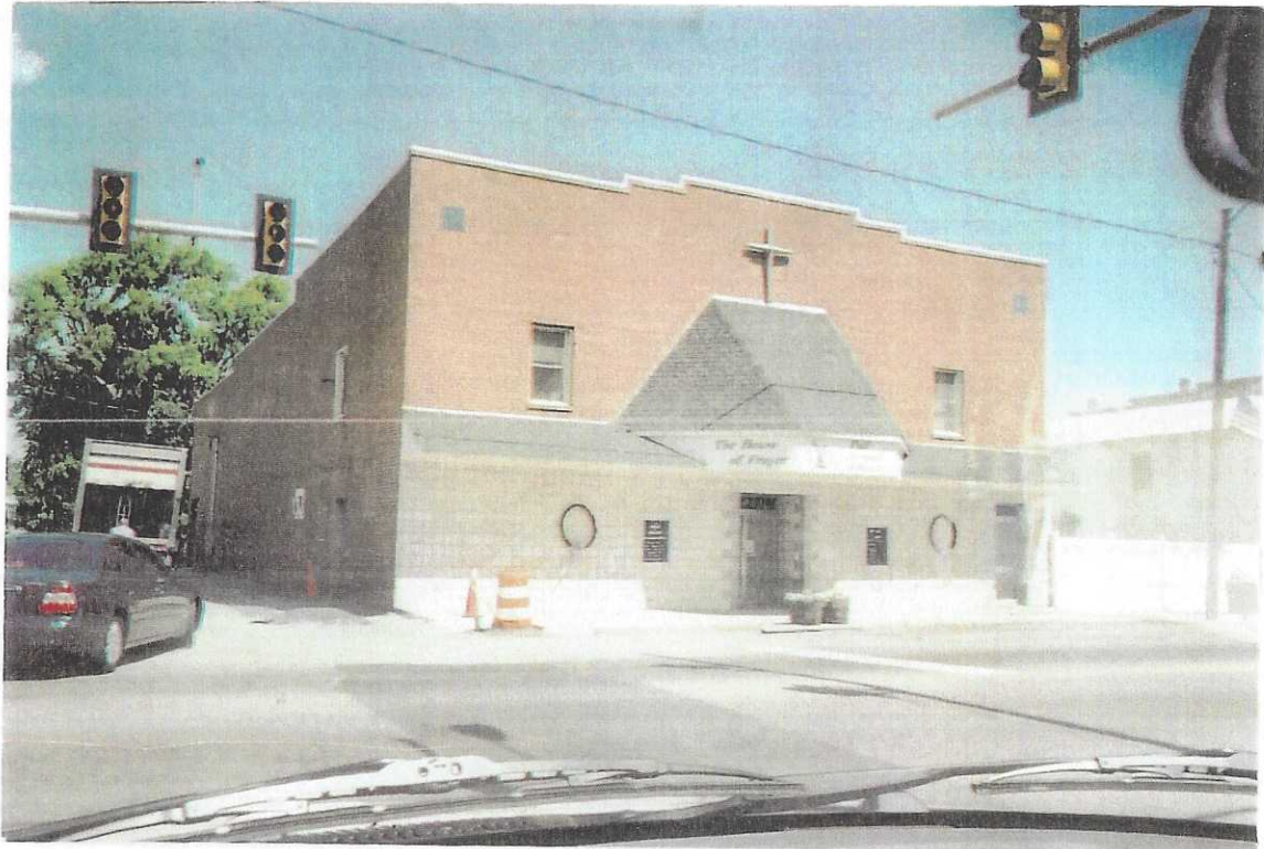
1 st photo